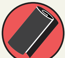
BLACK FABRIC [ 1 YARD ]